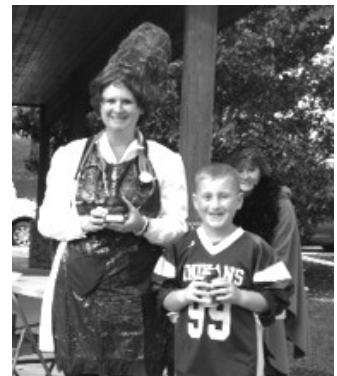
3rd Place Amateur Division LCHS HOSA